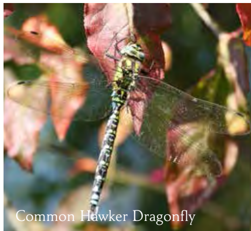
Common Hawker Dragonfly