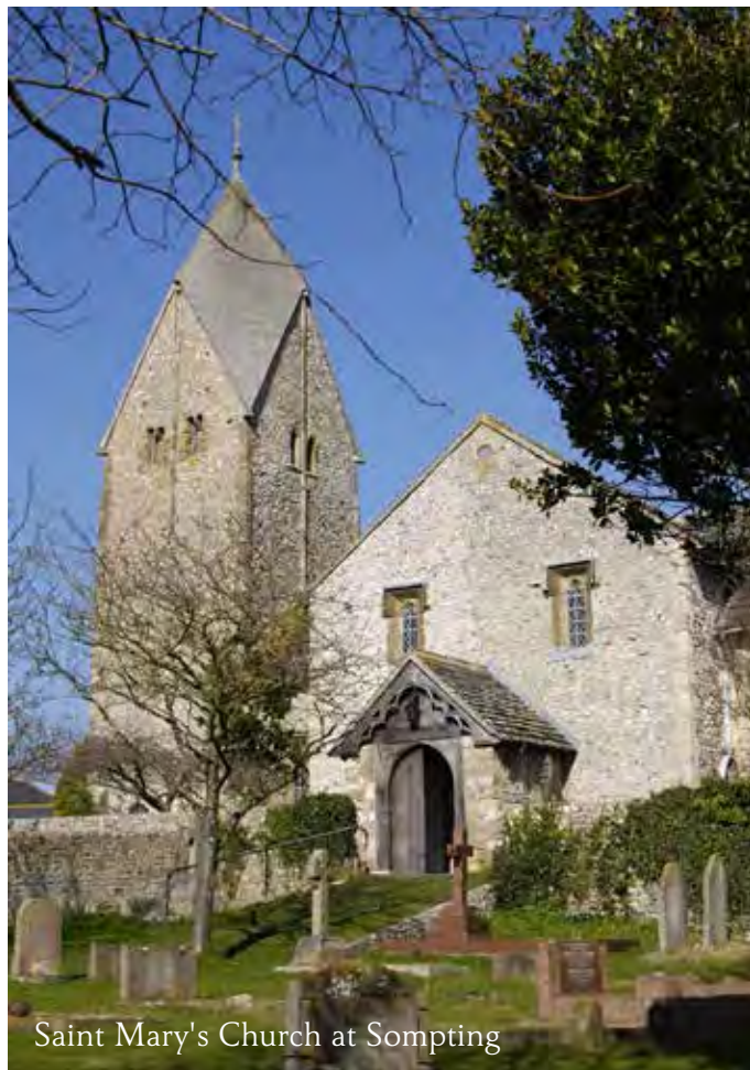
Saint Mary's Church at Sompting