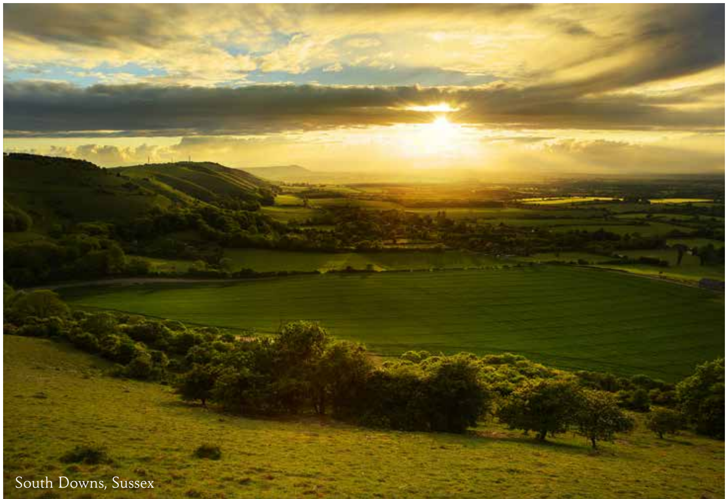
South Downs, Sussex