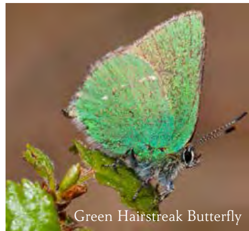
Green Hairstreak Butterfly