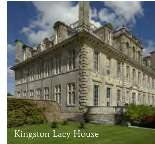
Kingston Lacy House