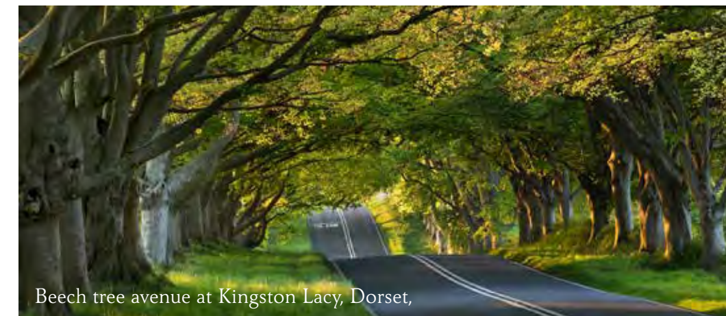
Beech tree avenue at Kingston Lacy, Dorset,