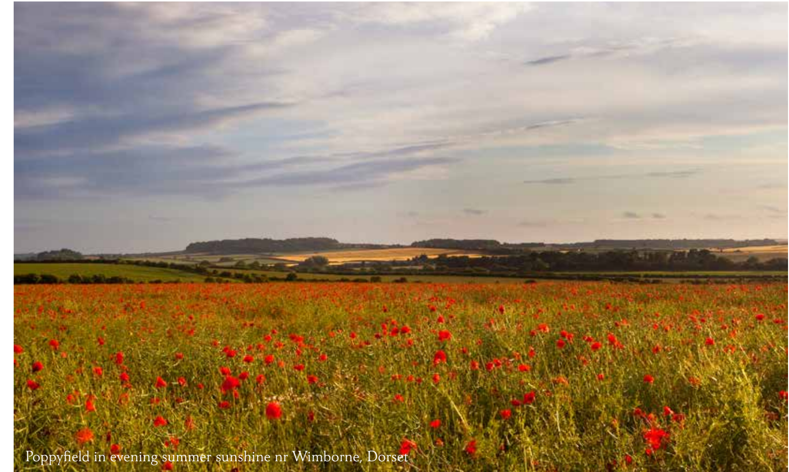
Poppyfield in evening summer sunshine nr Wimborne, Dorset