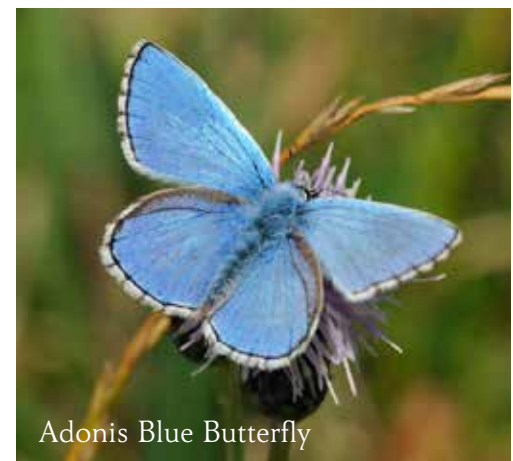
Adonis Blue Butterfly